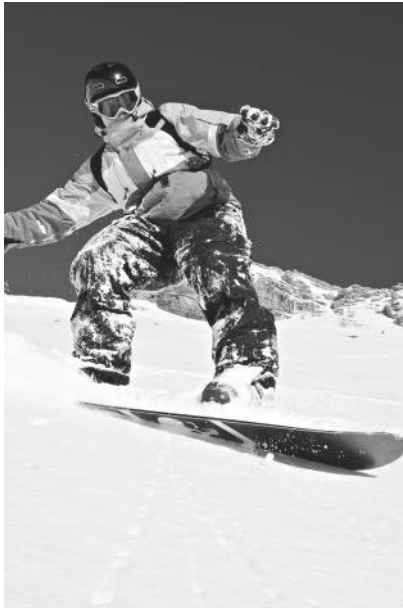
Fig. 2 for Question 2